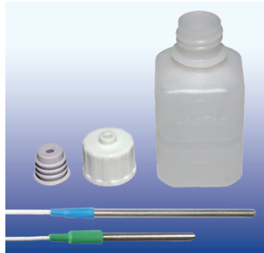
Glycol buffer (seal, cap and vial) with ST100K & ST10M sensor

The buffer is used with LogTag's ST100K-15 or ST100K-30 sensors connected to any TRED30-16R, UTRED/UTRED30 or TRES-8 temperature loggers and approx. 57ml (1.9 fl oz) of glycol. The buffer is also used with LogTag's ST10M-15 sensor connected to any TREL/TREL30 and UTREL/UTREL30 loggers. These items are not part of the kit and need to be ordered separately.